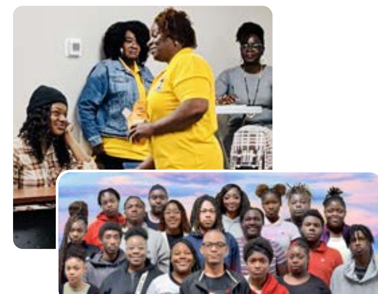
2023 Summer Youth Employment Program Participants

Exposure is very important to our teens. Special events and field trips help to broaden their understanding of the world around them and how they fit into it. College tours are popular field trips for youth enrolled in our programs.